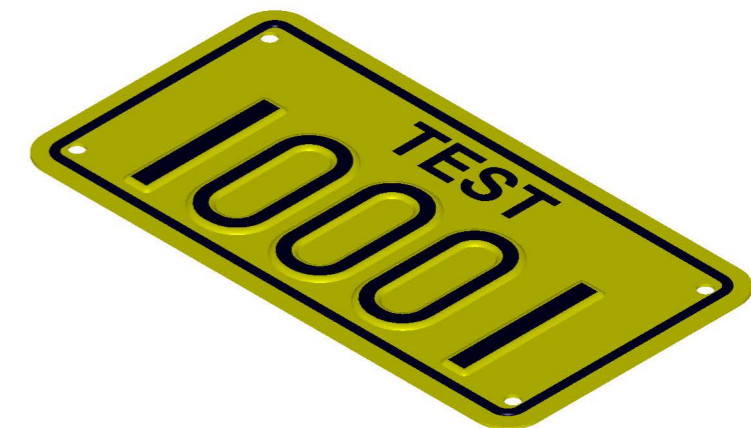
TEST NUMBER PLATE ISOMETRIC VIEW SCALE N.T.S.