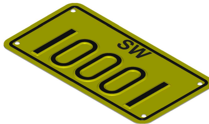
DISTRIBUTION SWITCHGEAR NUMBER PLATE ISOMETRIC VIEW SCALE N.T.S.