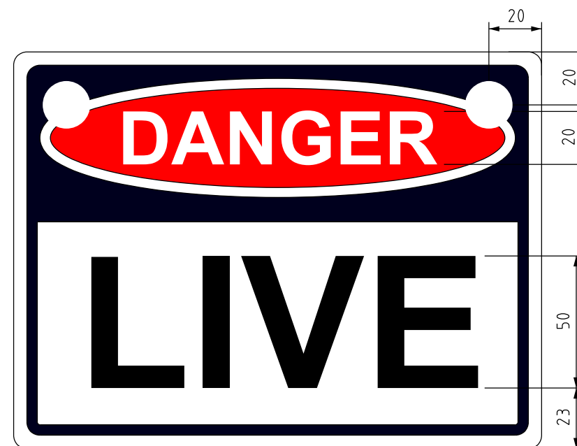
ITEM 7 PLAN VIEW