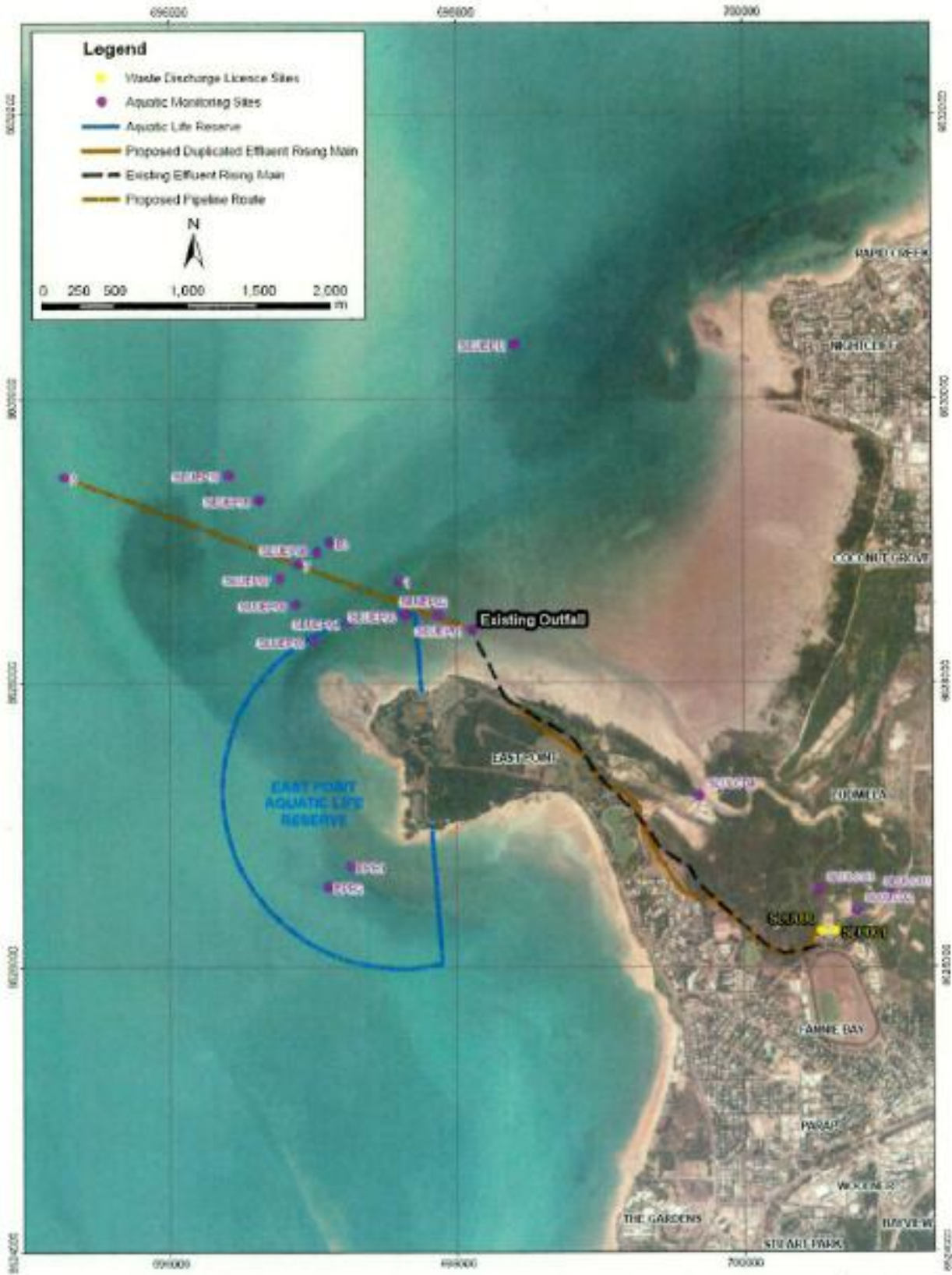
Existing outfall location, labelled "Existing Outfall" (Figure 4-1, Further Information)