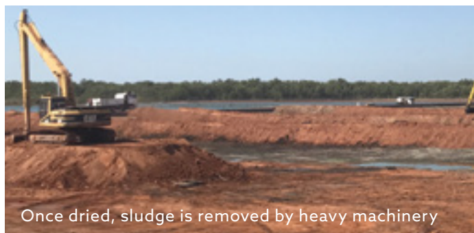
Once dried, sludge is removed by heavy machinery

The desludging works may create some odour and we're making every effort to reduce the impact on the neighbouring areas.