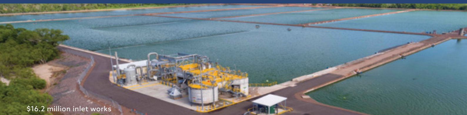
$16.2 million inlet works

Power and Water is always maintaining, repairing and upgrading our wastewater system to help protect public health and the environment.