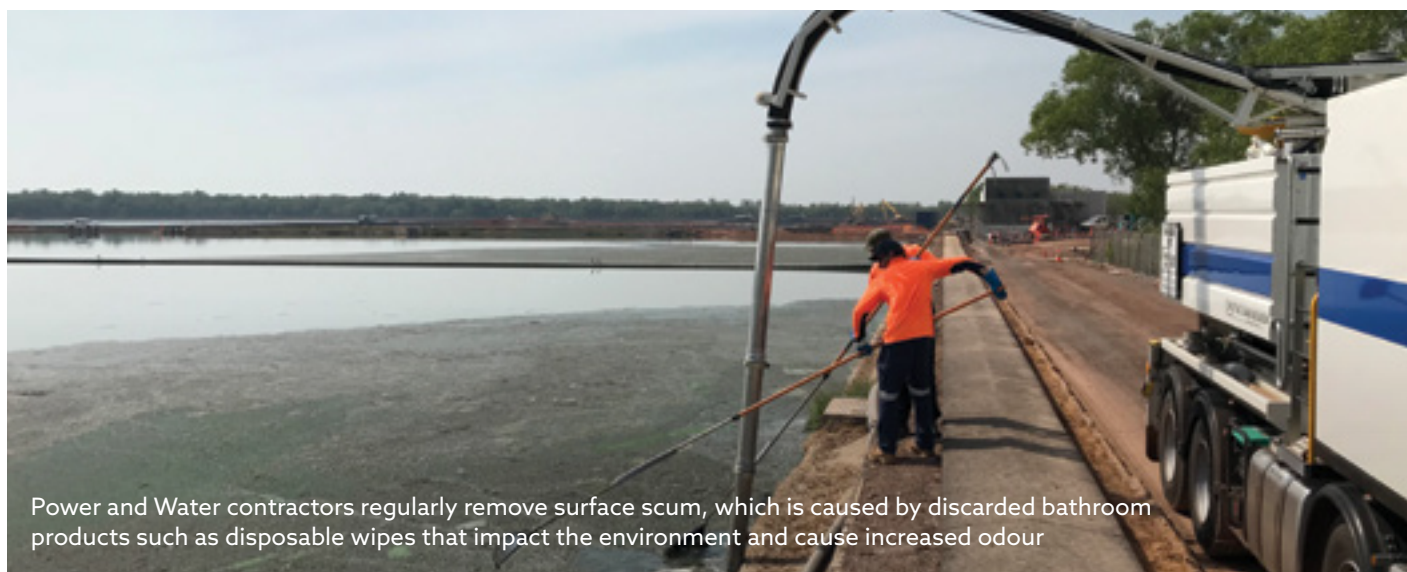
Power and Water contractors regularly remove surface scum, which is caused by discarded bathroom products such as disposable wipes that impact the environment and cause increased odour

Every year Power and Water spends around $1 million towards ponds maintenance and repairs and $2 million will be invested this year to implement continuous improvement projects.