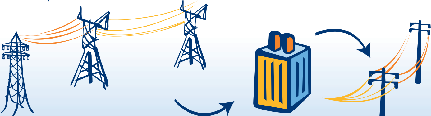
Transmission power lines